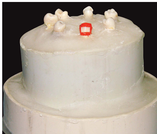
Figure 1 - Mounting the teeth with acrylic resin to the PVC bases.

Using self curing acrylic resin, each tooth was mounted in two PVC bases with different diameters, so that the buccal surface of each tooth formed a 90 degree angle with the acrylic base (Fig 1). This was necessary to standardize the traction tests in the universal testing machine.