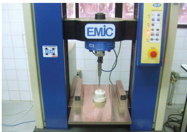
Figure 3 - Emic DL2000 universal testing machine.

The results (Table 2 and Fig 4) showed that there was a statistically significant reduction on the bond strength when compared to the Control group (19.52 kgf) and to the group where bonding was performed 24 hours after bleaching (12.31 kgf). When the bracket debonding strength was confronted with the Control group and the group where bonding was performed seven days after bleaching (18.44 kgf), it was noticed that there was no statistically significant differences.