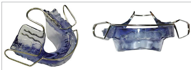
Figure 1 - Side and front view of Balters' bionator.

The descriptive data about age and time of treatment for the experimental and control groups are shown in Tables 1 and 2, respectively.