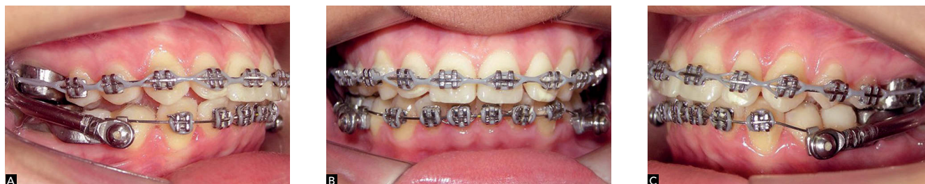
Figure 1 - Herbst appliance (CBJ) combined with fixed appliance: A) right lateral view, B) frontal view, C) left lateral view.

The sample consisted of 32 lateral cephalograms obtained at the onset ( T_1 ) and at the completion of the orthodontic treatment ( T_2 ), and 16 dental casts obtained at the onset of the treatment ( T_1 ) of 16 patients (10 females and 6 males) with Class II malocclusion (14 patients with Class II, division 1 malocclusion; and 2 patients with Class II, division 2 malocclusion). These patients presented median initial and final ages of 14.04 (interquartile deviation of 3.68; amplitude of 11.50–35.66) and 17.14 (interquartile deviation of 4.07; amplitude of 13.68–38.64) years, respectively, and were treated for an mean period of 2.52 years (SD = 1.00). They also presented mean overjet of 6.7 mm, evaluated on the initial dental casts ( T_1 ). Considering the severity of anteroposterior relationship between the dental arches, four patients presented \frac{1}{2} Class II, four patients presented \frac{3}{4} Class II and eight patients had complete Class II. Criterion adopted to classify them as patients at post-peak stage of growth was the evaluation of skeletal maturation stages of the median phalanx of the third finger on carpal radiographs. The patients were considered as patients at post-peak stage of growth when the radiographic interpretation comprised the stage in which the epiphysis did not present the width of the metaphysis up to the stage with complete fusion of epiphysis and metaphysis 7,16 (Table 1).