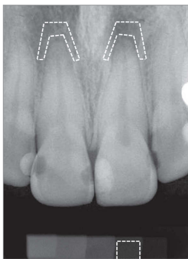
Figure 2 - Scanned periapical radiograph; region of interest selected in apical region of upper central incisors and on second step of aluminum step-edge (assessed using Adobe Photoshop CS2 software histogram tool).

Periapical radiographs of the upper incisors were taken using X-ray equipment (RX Timex 70 C, Gnatus, Ribeirão Preto, SP, Brazil) operating with 70 kVp, 7 mA and a 0.25-second exposure time. A five-step 2 x 20 x 3.5 mm aluminum wedge (Al step-edge) was attached to the apical region perpendicular to the film (Agfa Dentus M2 "Comfort"). Kodak developing and fixing solutions (Kodak Brazil, Commerce and Industry Ltda, São