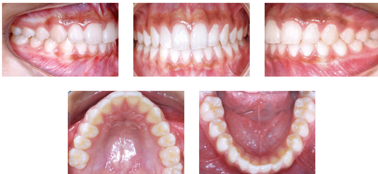
Figure 1 - Occlusal characteristics of a female patient from the Japanese-Brazilians sample.

The sample presented with all permanent teeth in occlusion (the presence of second and third molars was optional), absence of orthodontic treatment, normal occlusion or Class I malocclusion. Crowding not greater than 2 mm was acceptable (Fig 1).