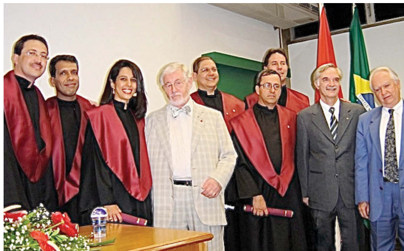
Master's group (2005) at Sacred Heart University, Bauru/SP.

This group friendly welcomed me to join them on those trips. That was how I had the opportunity to take my first specialization course in Restorative Cosmetic Dentistry. Afterwards, I wisely decided to live in Bauru, not only due to the wide scope of the course,