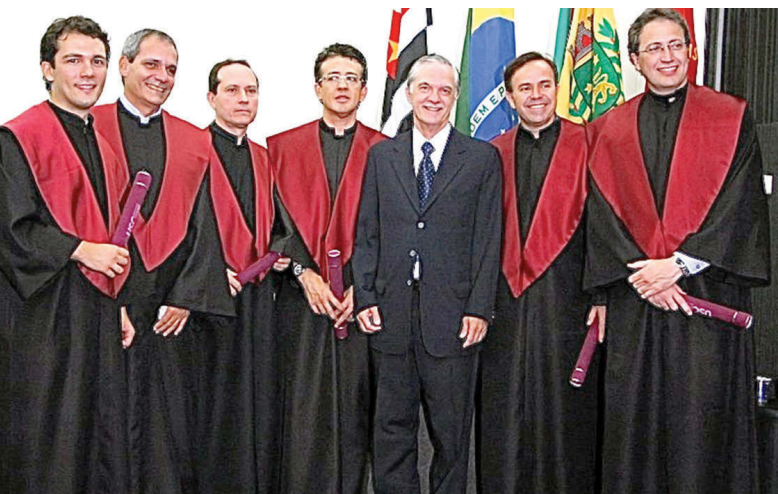
Doctorate's group (2010) at Sacred Heart University, Bauru/SP.