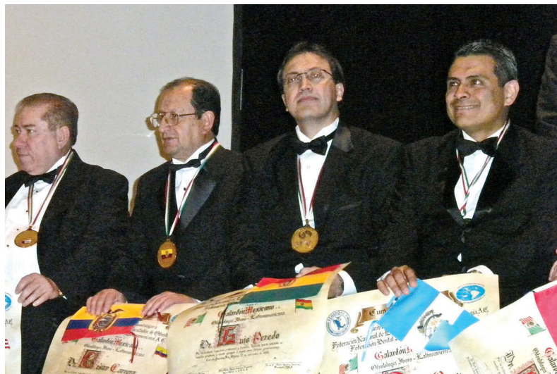
Receiving the Galardão Mexicano award in Cancun with renowned colleagues from other countries.

We need to be aware of the advances in technology, but without necessarily being the first ones to catch or hop into the train.