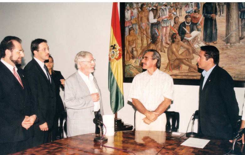
Giving thanks to and welcoming Prof. Brånemark at Santa Cruz de La Sierra/Bolivia (Legislative Council, 2005).